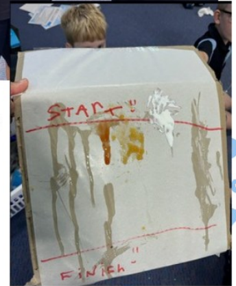
Liquid Race experiment

The students have been busy in the garden, they have added new compost, mulch and begun planting seeds.